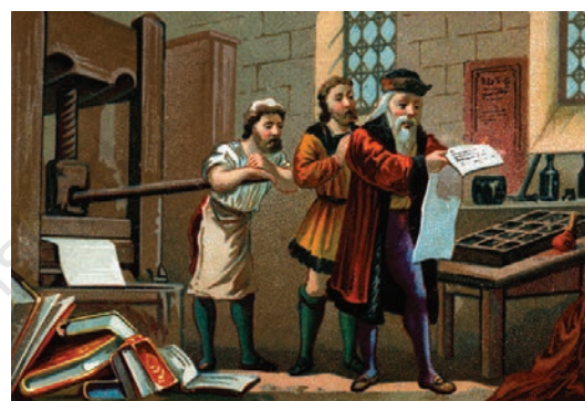
An artist's impression of Gutenberg printing the first sheet of the Bible.

Look at the collage on the left and list six various kinds of media that you see.