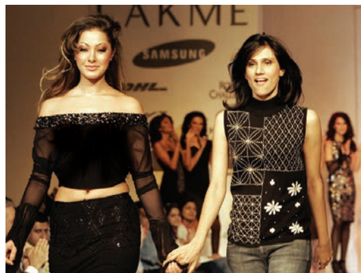
Fashion shows are very popular with the media.

As citizens of a democracy, the media has a very important role to play in our lives because it is through the media that we hear about issues related