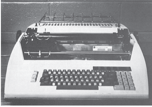
With electronic typewriters, journalism underwent a sea-change in the 1940s.